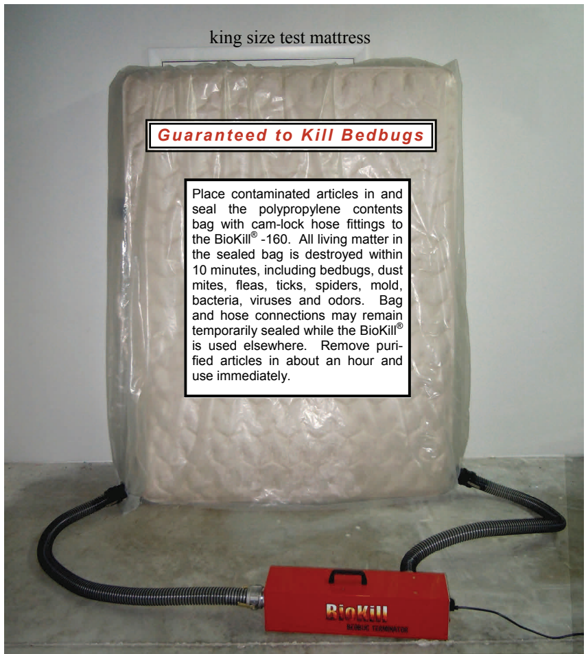
Guaranteed to Kill Bedbugs

Place contaminated articles in and seal the polypropylene contents bag with cam-lock hose fittings to the BioKill® -160. All living matter in the sealed bag is destroyed within 10 minutes, including bedbugs, dust mites, fleas, ticks, spiders, mold, bacteria, viruses and odors. Bag and hose connections may remain temporarily sealed while the BioKill® is used elsewhere. Remove purified articles in about an hour and use immediately.